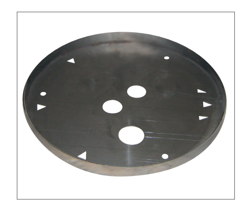
Easy installation thanks to the bottom sidewall of the curtain for easy preparation of the media connection and electric wiring.