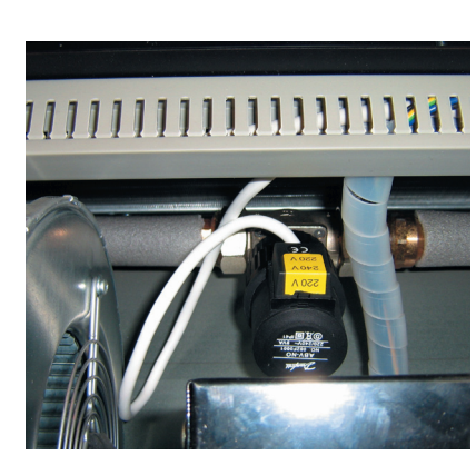
Built-in thermoelectric valve controls temperature of exhausted or spatial air.