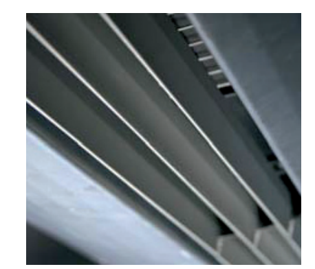
Maximum energy savings through optimum configuration of the exhaust adjustable fins.